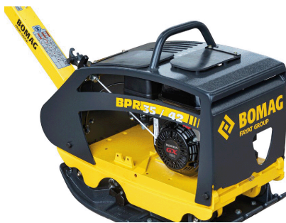
Robust and reliable Best component protection