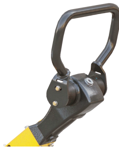
Precise and save to operate Comfortable control lever