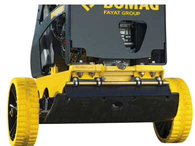
Simple and safe transport Transport wheels (optional)